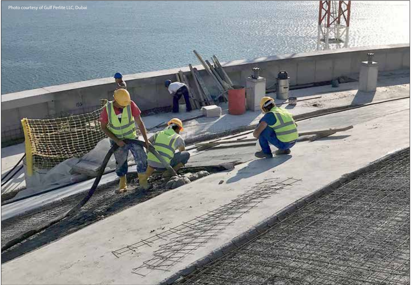
Perlite lightweight concrete forms the roof of this liquefied natural gas (LNG) storage tank